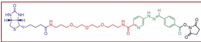
Figure 1: Structure of SureLINK Chromophoric Biotin Biotin (blue); PEG spacer (red); bis-aryl hydrazone chromophore (green); Amine-reactive succinimide ester (black)

Improve detection in your immunoassay! SureLINK Chromophoric Biotin contains a long spacer arm (Figure 1) which improves solubility of the conjugate and minimizes steric hindrance among multiple biotinylated sites in detection applications. It also has an amine-reactive succinimide ester (NHS ester) that efficiently couples to protein primary amine groups.